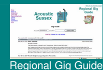
Regional Gig Guide

Don't forget that as well as our own shows, the Acoustic Sussex website has a Regional Gig Guide and links to venues and clubs in the South East that offer folk, roots and acoustic music – and our MySpace site contains over 500 links to a variety of other MySpace 'friends' sites, including musicians, venues, magazines and lots more.